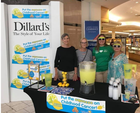
(L&R) Atlantic, NICU Friends & West Ghent Circles put the squeeze on Childhood Cancer in July while hosting a LemonAid stand.