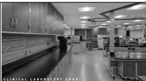
CLINICAL LABORATORY CHKD