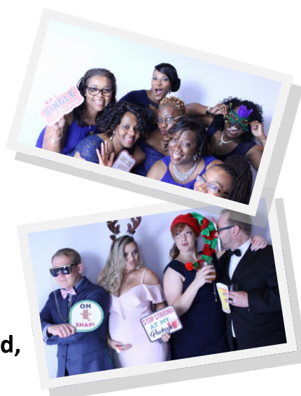
M&M 2017 Committee