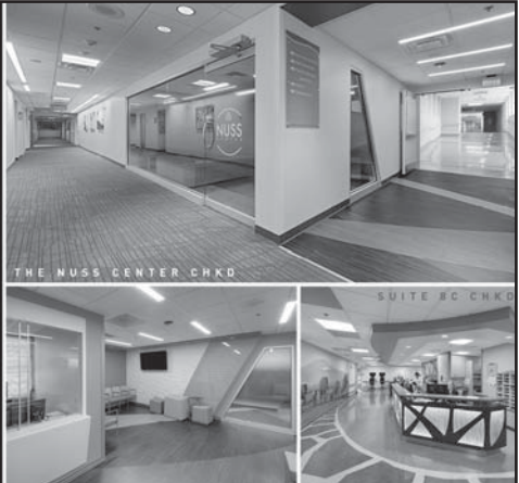
THE NUSS CENTER CHKD