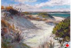
East Beach Plein Air Painting Escape A BENEFIT FOR CHILDREN'S HOSPITAL OF THE KING'S DAUGHTERS

Join the East Beach Circle for their annual BAKE SALE Saturday, April 29, 2017 at 9:00 AM to 5:00 PM East Beach Neighborhood 28th Bay Street and Hammock Avenue Norfolk, VA 23518