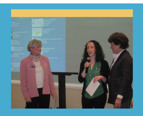
April KD Connect

Over 80 Circle members attended the April 12 KD Connect. Members gained insight on project basics, partnering with other Circles & more! Thank you to all who came to the event.