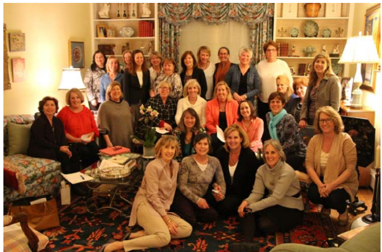
Pictured: Horizon Circle members at their March 2015 Circle & March Mah Jongg event planning meeting.